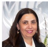
Ms Rola Dashti , Under-Secretary-General and Executive Secretary, Economic and Social Commission for Western Asia