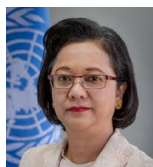
Ms. Armida Salsiah Alisjahbana , Under-Secretary-General and Executive Secretary, Economic and Social Commission for Asia and the Pacific