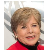
Ms. Alicia Barcena , Under-Secretary-General and Executive Secretary, Economic Commission for Latin America and the Caribbean